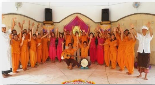
Your Shambala Team

We are looking forward to working with you and helping you make your stay with us at Shambala in Bali a Dream Come True!